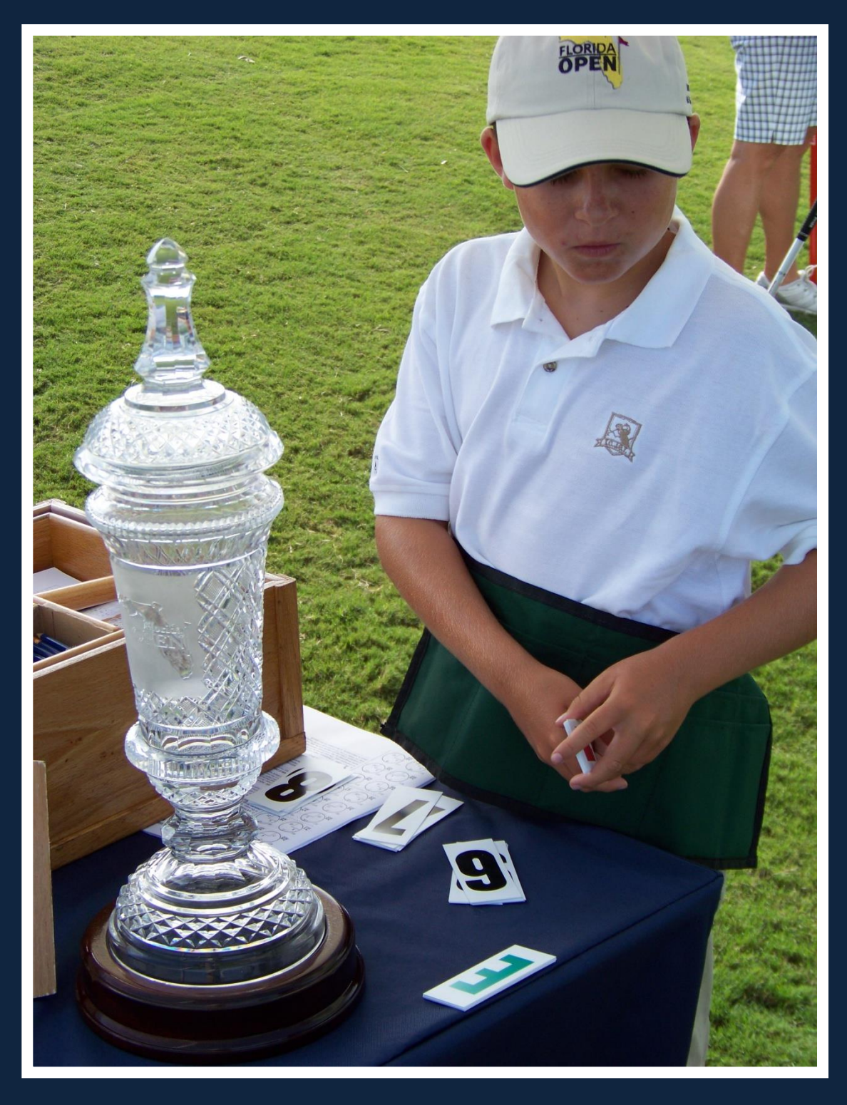
Preserving and protecting the game for future generations